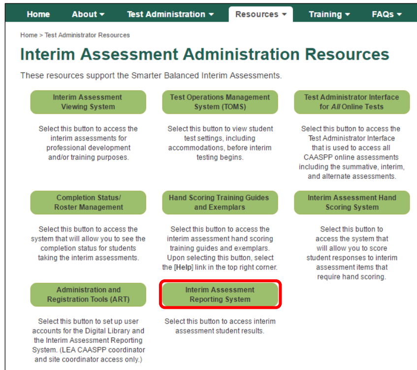
Figure 88. Buttons on Interim Assessment Administration Resources Web Page