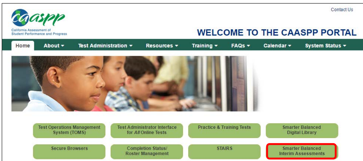
Figure 87. Buttons on CAASPP Portal Web Site