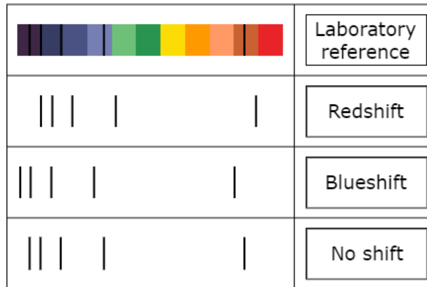
Screen capture of item 32 key