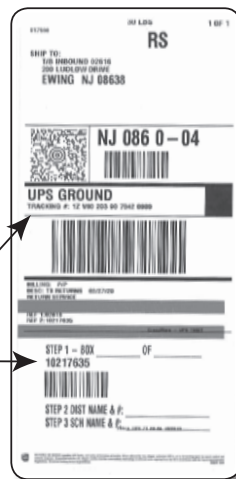
UPS Return Label

Note the tracking and reference numbers for local records.